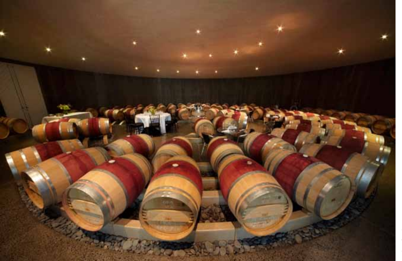
Barrel cellar at Boxwood.