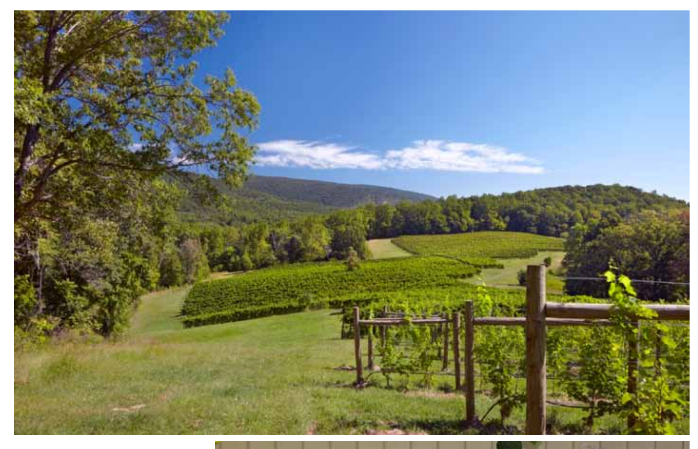
Day 4 continued: David Copp at Monticello

Andrew commented that although Virginia as a whole makes 350,000 cases of wine, this is equivalent only to Kendall-Jackson's Chardonnay production! Virginian wine comprises 4% of wine consumption in the state.