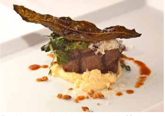
Emu breast at the Ashby Inn, above, and beef flat iron steak at Palladio.

I was a little concerned that the next dish, veal breast, celeriac, pickled lemon, coriander, nasturtium, tannic veal reduction, would be overwhelmed by the previous one, but I