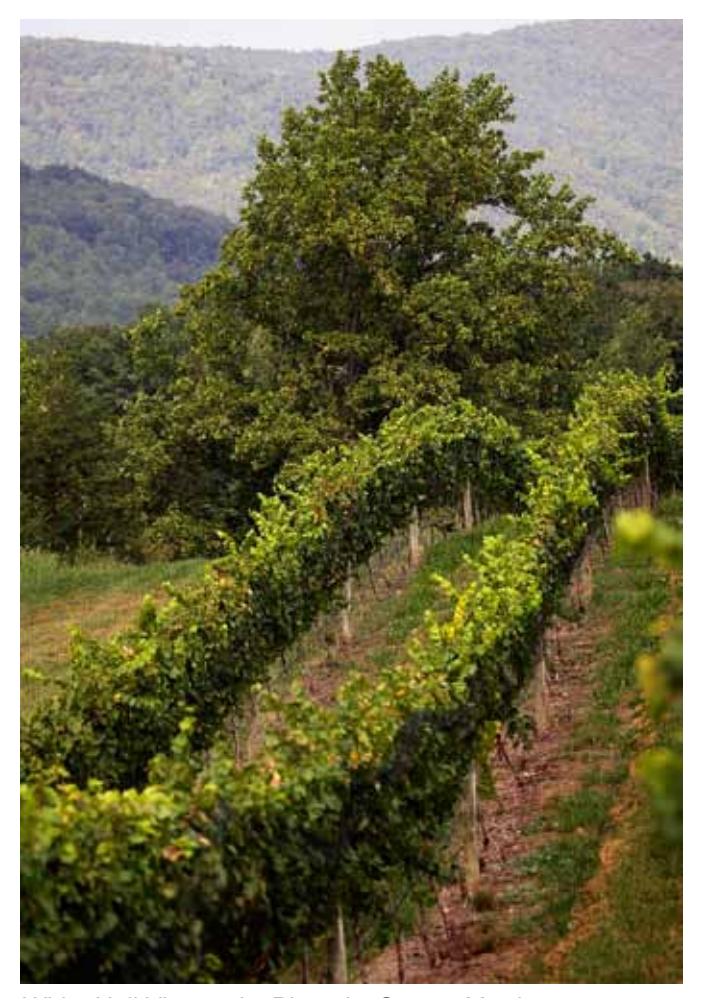
White Hall Vineyards.

Curiously, a number of his reds had a distinctly cherry nose and palate; when questioned, he attributed it to his use of Cabernet Franc in the various blends. For me, given his house style, his best red wine was the Petit Verdot 2007, which was juicy and balanced and relatively light, with very little oak; it is, or will be, available in the UK. He also produced, in the Soliterre 2007, the only cryogenic wine which I knowingly tasted.